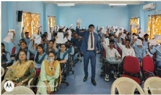
Seminar by Khadanga sir and swastik sir