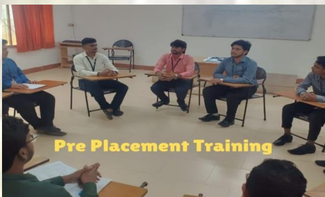
Pre Placement Training